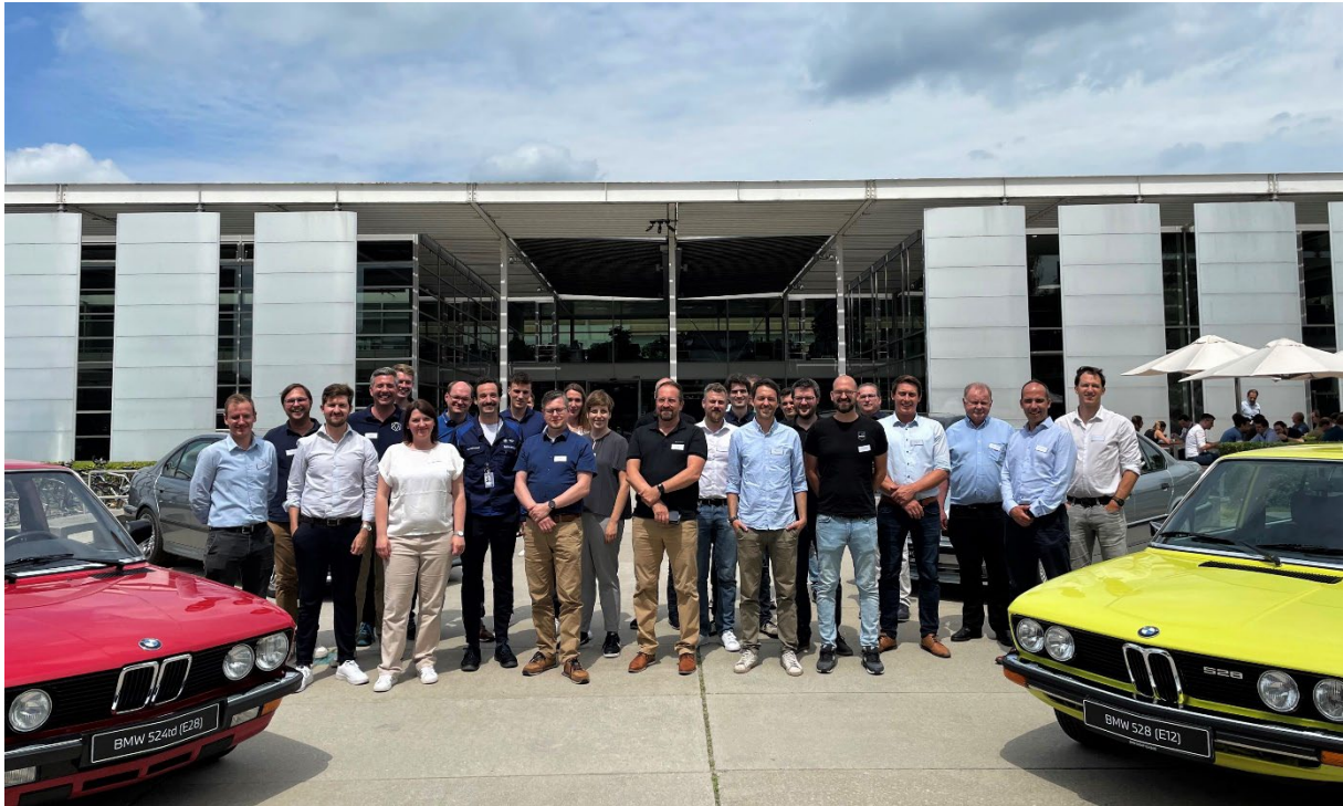
Group of POLYLINE project partners